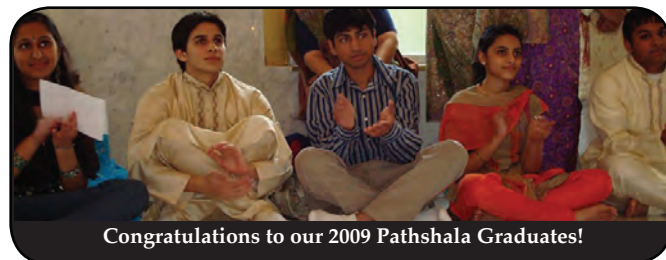
Congratulations to our 2009 Pathshala Graduates!