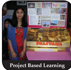
Project Based Learning