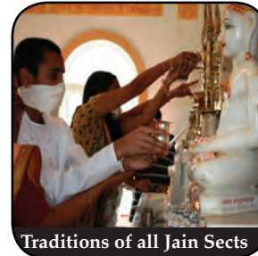
Traditions of all Jain Sects