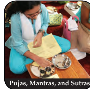
Pujas, Mantras, and Sutras